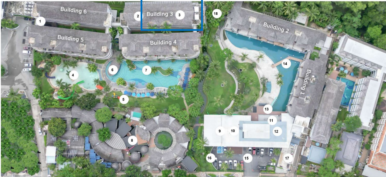
Holiday Ao Nang Beach Resort, Krabi